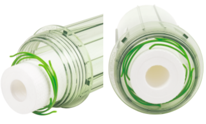
Filter Housing with Centralizing Ring. Filter cartridge is stabilized in the center of the housing.

Reduces the risk of damage to the cartridge and housing elements at installation.