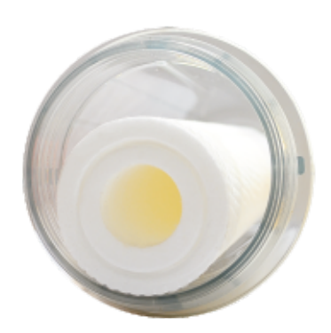
Filter Housing without Centralizing Ring. Filter cartridge falls to the side, unsupported.

Bacteriostatic Filter Cartridge Centralizing Ring